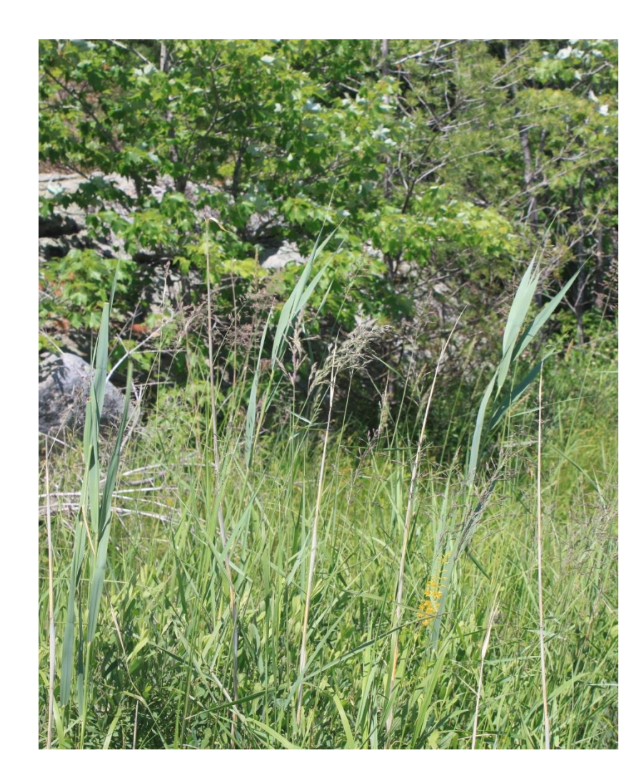
Township of the Archipelago, Carling, and Massasauga Provincial Park Phragmites 2024