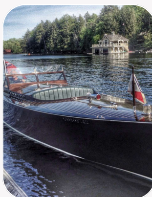
Classic Boat Tour & Auction

MAY 14-28 - auction JULY 25 - live event