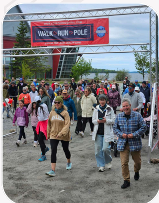
Walk, Run, Pole