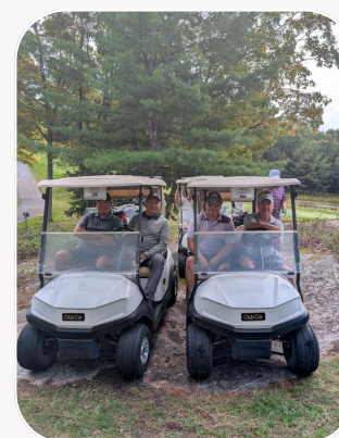
Driving for Diagnostics