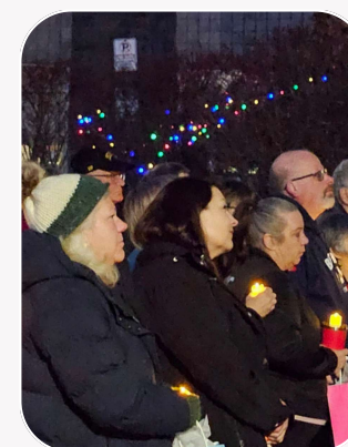
Lights of Love