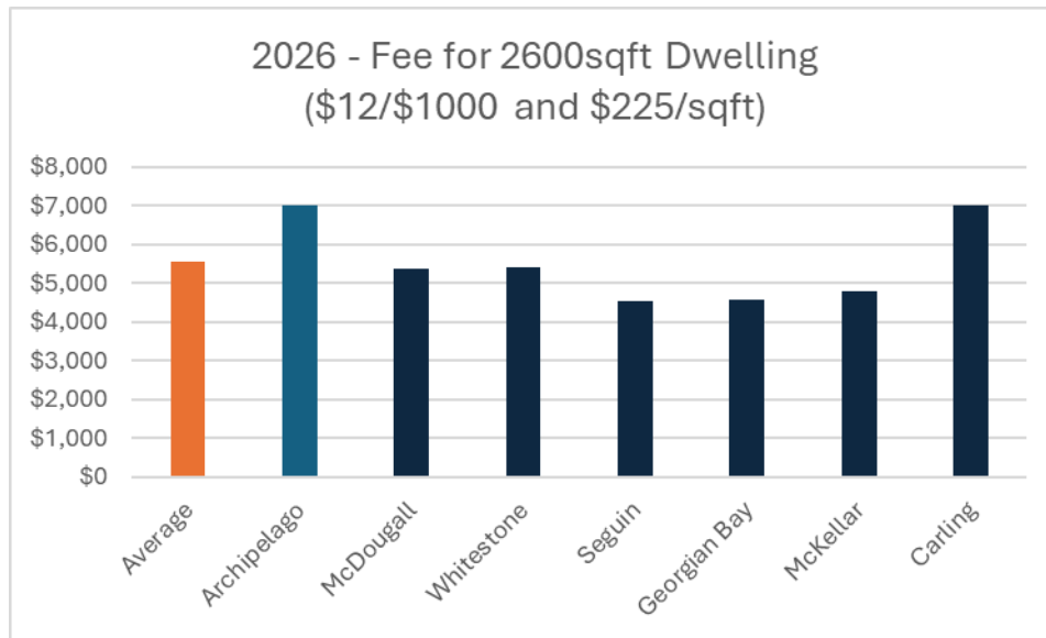
Average $5541. Archipelago $7020 Pier foundation used – some townships charge extra for basements