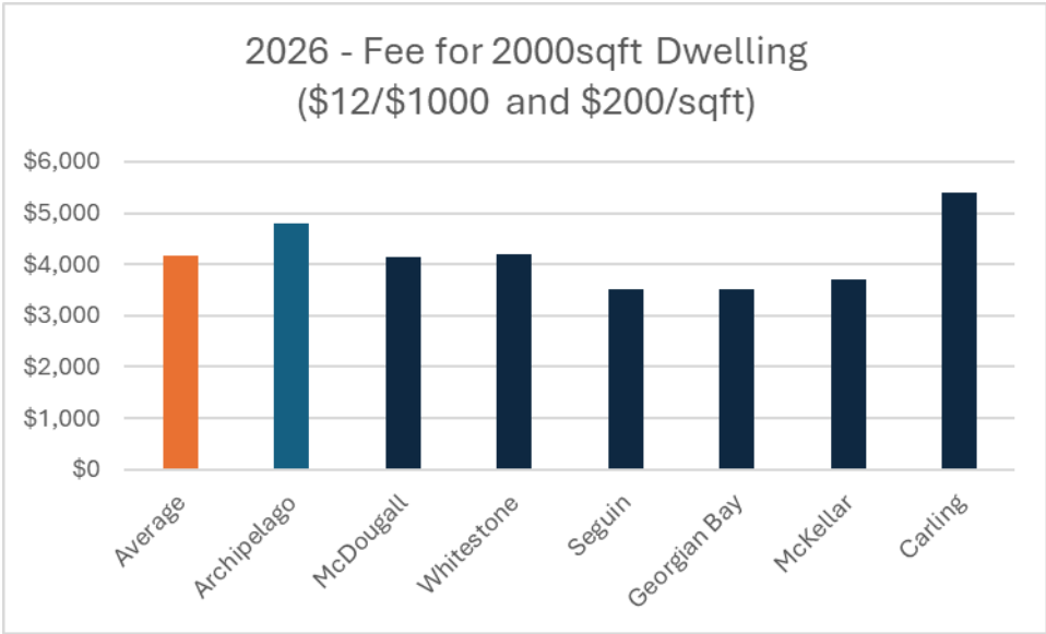
Average $4181. Archipelago $4800 Pier foundation used – some townships charge extra for basements