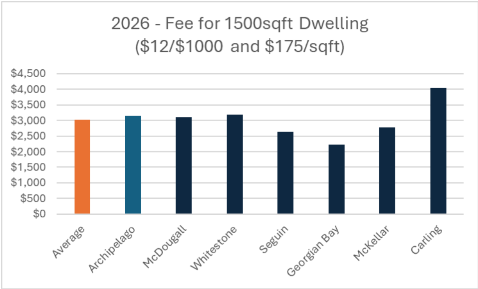
Average $3018. Archipelago $3150 Pier foundation used – some townships charge extra for basements